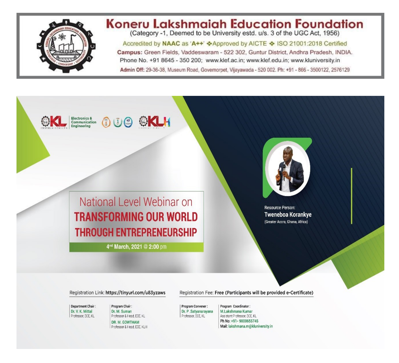
Fig. Poster of webinar